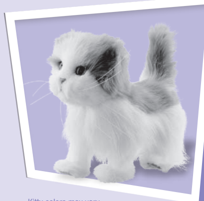
Kitty colors may vary.